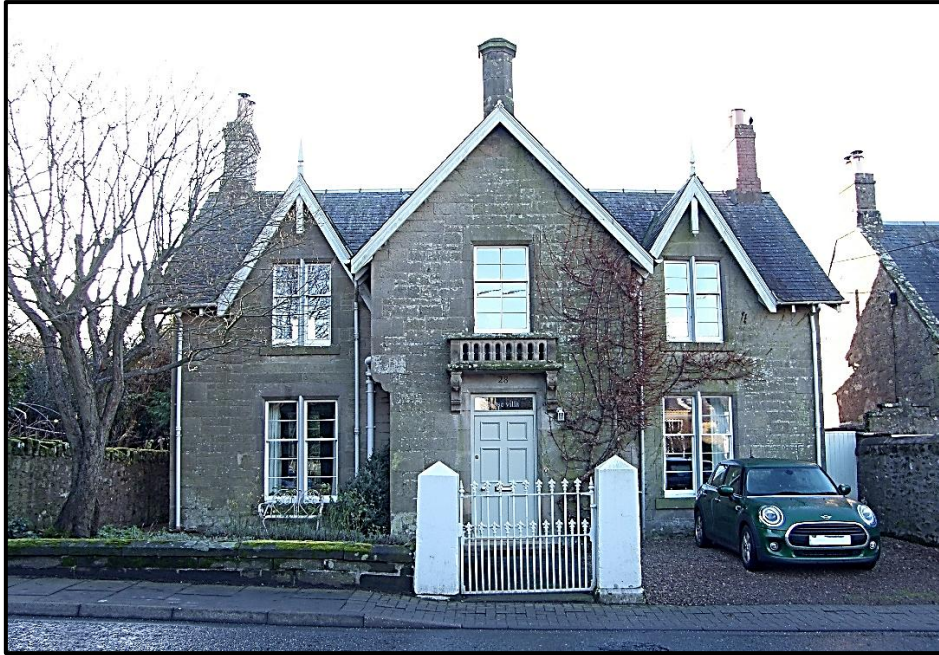
Many identical architectural features at Rose Villa, 28 Bridgend (above) and numbers 22 and 20 Bridgend (below)