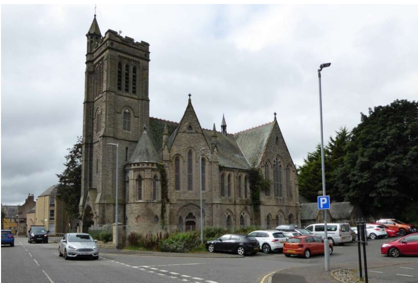
former Trinity Church on Bowmont Street, Kelso

It presumably cannot be coincidental that a treasured possession of the Gillespie Church is a communion cup inscribed “United Associate Congregation Kelso 1836”, not far from Duns. This congregation originated as Kelso Secession Church becoming successively part of the Burgher, United Associate, United Presbyterian and United Free Church denominations. It entered the Church of Scotland at 1929 great reunion and was called Kelso Trinity. It closed in 1981 and is currently disused. There are 4 cups with the same inscription “United Associate Congregation Kelso 1836” still held by Kelso North congregation 41 , the church with which the Trinity united. It was not unknown for churches to donate surplus communion-ware overseas after a local union but Trinity did not join with another church until 1940 – is a more likely link that it was rebuilt in 1886, so only just before the congregation at Mount Ayliff was founded and the Hunters set out?