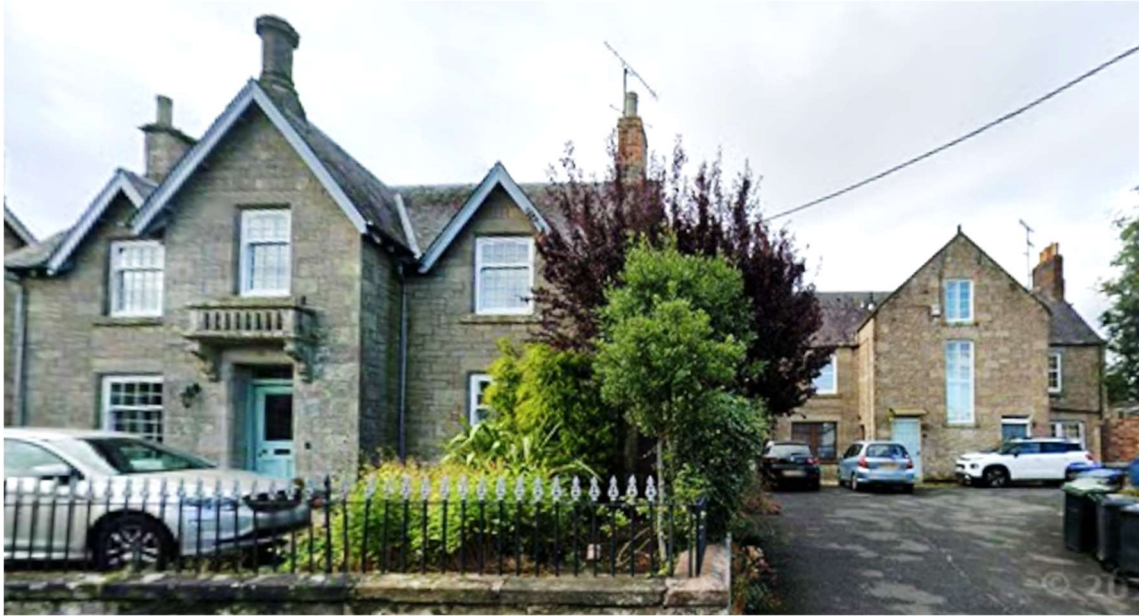
Elm Bank #20 and #18 Bridgend, Duns; #22 out of shot to left is identical to #20