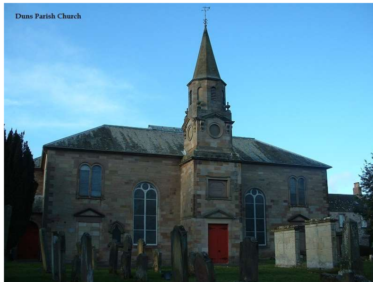
Duns Parish Church