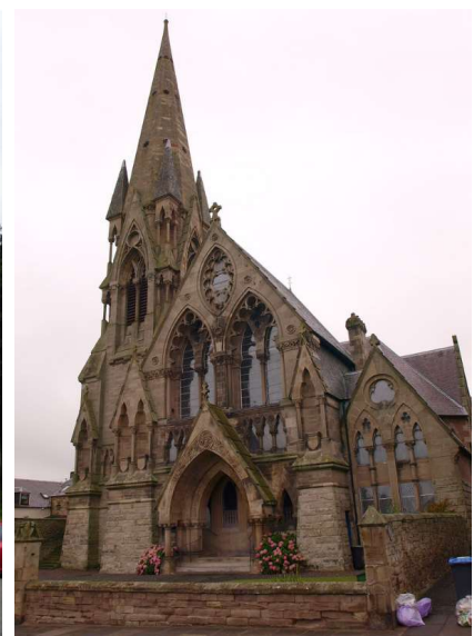
Kelso North Church of Scotland