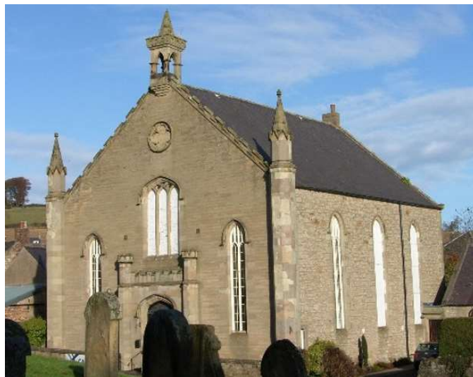
former South Church on Currie Street, Duns – photographed from Duns churchyard