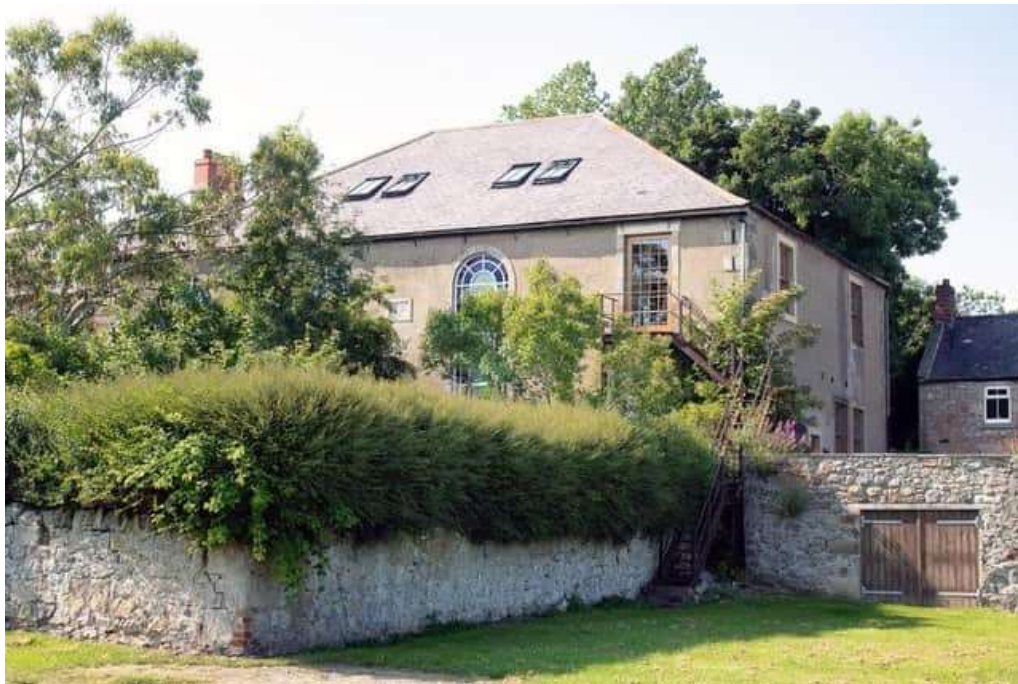
Lowick Scotch Church