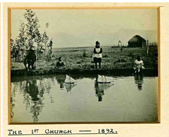
original Gillespie Mission Church