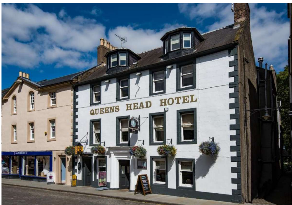
Queen's Head Hotel on Bridge Street, Kelso