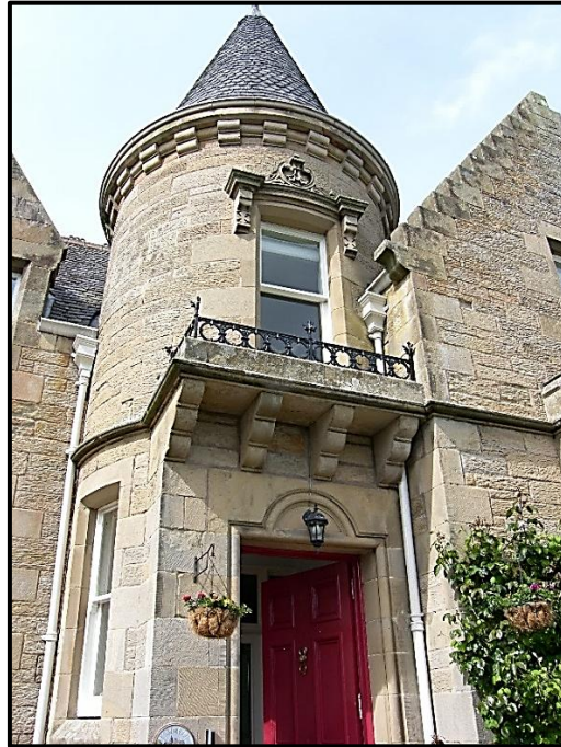
Corbelling at three levels on the drum tower

evidence – below the small balcony above the front door; under the decorative ledge at the first-floor window immediately above; and supporting the tower spire. Crow-stepped gables and fired clay ridge tiles on the main roof confirm the building's traditional roots.