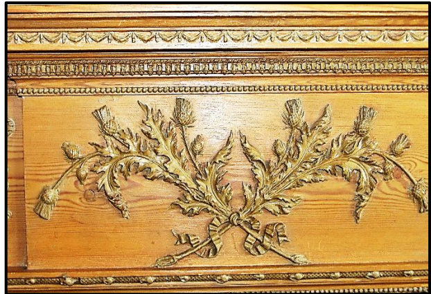
Original plaster cornice and timber fireplace detail at Kirkwell House