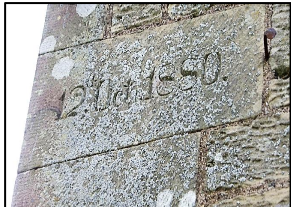
Carved cross on one corner-stone and date inscription (12 th Oct 1880) on another